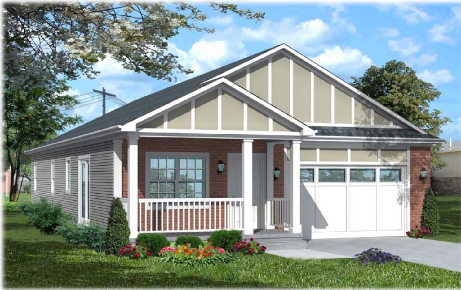
Artist's depiction. Exact elevation and floor plan may vary according to homeowner and site specifications.

1,505 Square Feet Ranch 4 Bedroom, 2 Bath