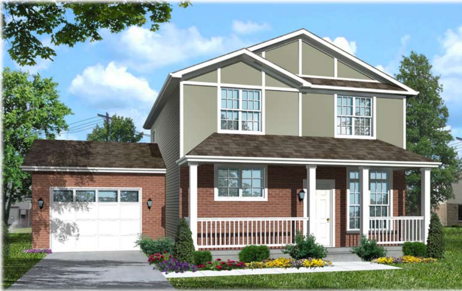
Artist's depiction. Exact elevation and floor plan may vary according to homeowner and site specifications.

1,728 Square Feet Colonial 3 Bedroom, 2-1/2 Bath